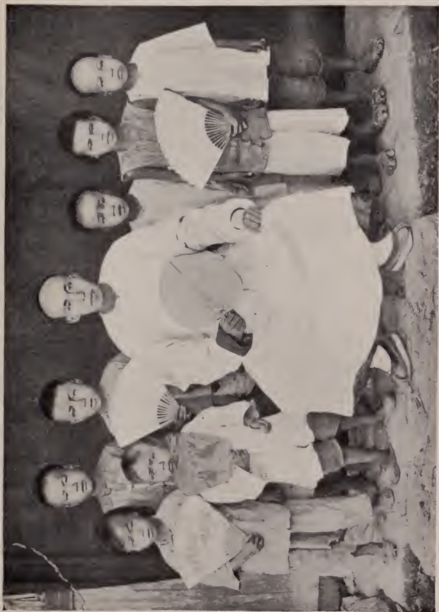
MASTER AND PUPILS OF A DAY SCHOOL.